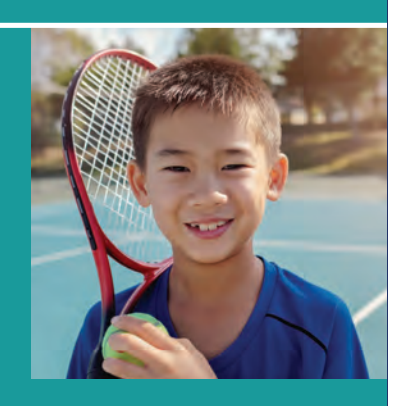
Choose from: Tennis, Cricket or Multi-Sports!

Must have a valid Oakville Public Library card.