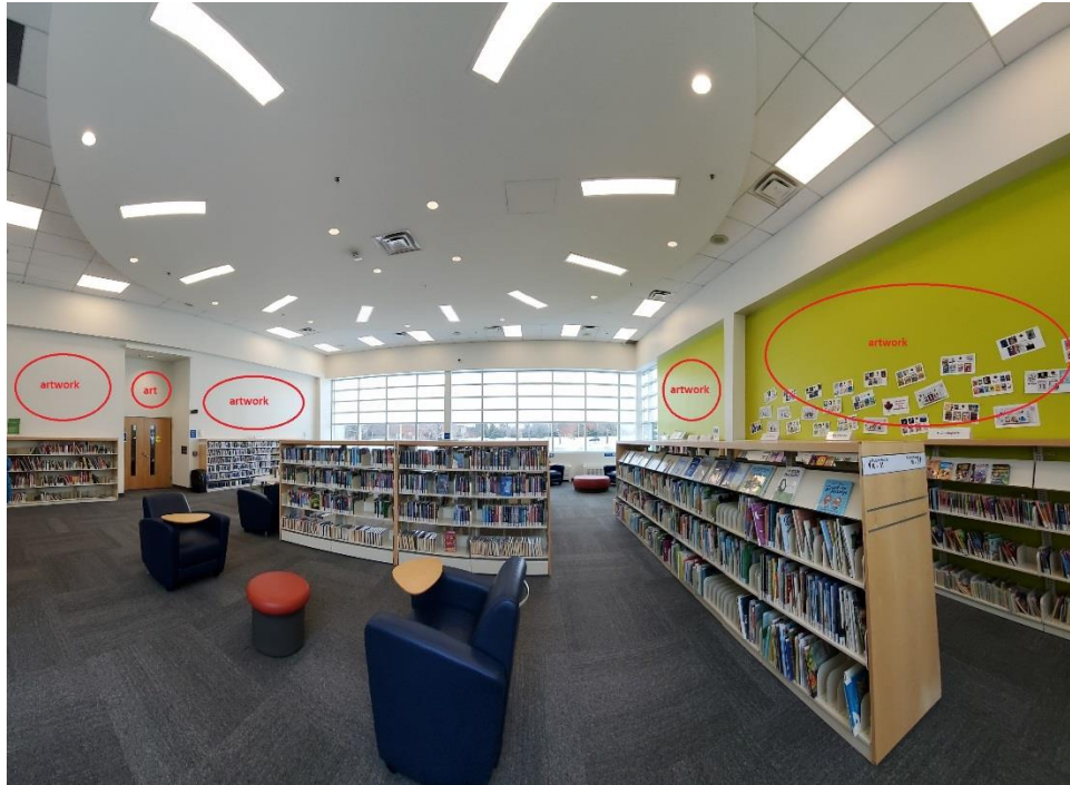
Appendix B: Site 1 Kid's Zone, south-east wall above book shelves.